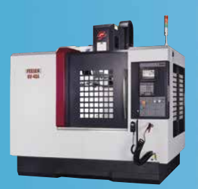
Machine tools and accessories