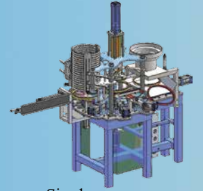
Single-purpose machines and equipment